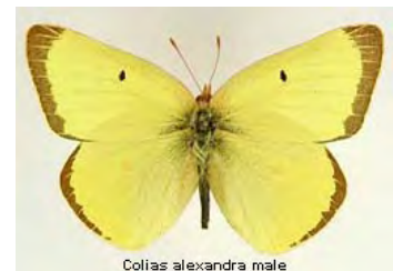
Colias alexandra male