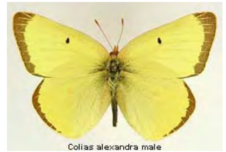
Colias alexandra male