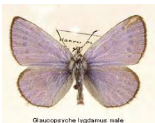
Glaucopsyche lygdamus male