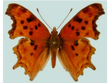
satyrus) Can be found in mountain canyons from March until June. A fresh generation appears from July to September.