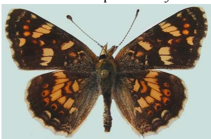
Field Crescent ( Phyciodes pulchellus camillus) Flies in canyons and gullies during the spring and summer months. Larvae feed on blue aster.