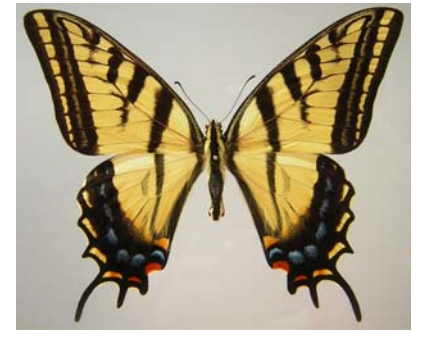
Two Tailed Swallowtail ( Papilio multicaudatus pusillus ) Female is pictured.