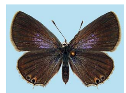
Western Tailed Blue (Everes amyntula) Female