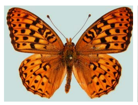
Great Basin Fritillary (Speyeria egleis utahensis) Starts flying in our canyons in mid-June.

Towards the latter part of June and into July, other species of fritillaries begin to fly and may visit Wasatch Canyons. These include the great basin fritillary ( Speyeria egleis utahensis ), northwestern fritillary ( Speyeria hesperis wasatchia ), and great spangled fritillary ( Speyeria cybele letona ). The great basin wood nymph ( Cercyonis sthenele masoni ) also starts flying in and around the oaks as well as the taxiles skipper ( Poanes taxiles ).