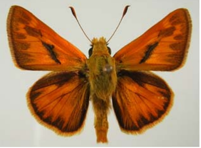
Woodland Skipper (Ochlodes sylvanoides napa) Male pictured. This skipper emerges in the mouths of canyons in late August and can be very commonly found on flowers in September, October, up to hard freeze.