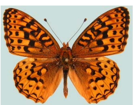
Northwestern Fritillary ( Speyeria hesperis wasatchia ) Males are more common in Wasatch Canyons at roughly 7,000 feet and may be uncommon at Wasatch Canyons.