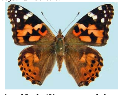
Painted Lady (Vanessa cardui) Migrates into Northern Utah on a limited to massive basis every spring. Equally at home in mountain canyons as well as city parks and agricultural areas where their caterpillars feed on thistles.