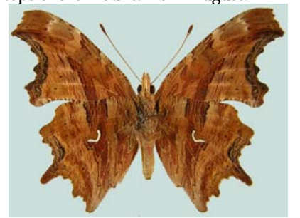
satyrus) Picture of male ventral surface.