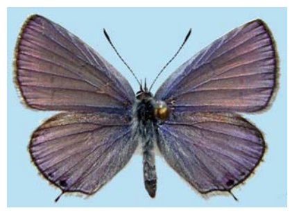
Western Tailed Blue (Everes amyntula) Males fly in isolated colonies along hillsides in association with its larval food plant--Lathyrus.

Soon after the two tailed swallowtail starts flying, other butterflies that appear during the month of May might include the western tailed blue ( Everes amyntula ), field crescent ( Phyciodes pulchellus camillus ), common ringlet ( Coenonympha tullia brenda ), and clodius parnassian ( Parnassius clodius menetriesi ).