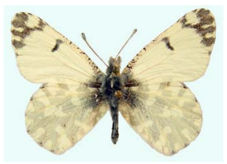
Large Marble (Euchloe ausonides coloradensis) Flies along dry ravines and mountainsides in mid April.