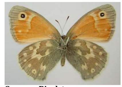
Common Ringlet (Coenonympha tullia brenda) Female ventral surface is pictured.