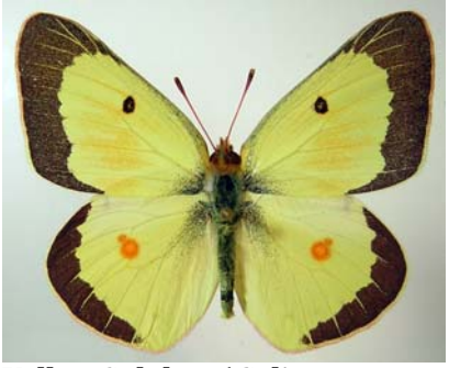
Yellow Sulphur ( Colias philodice eriphyle ) Populations of this butterfly come from alfalfa fields or from canyons where larvae feed on alfalfa ( Medicago sativa ), sweet clover ( Melilotus officinalis ), or other legumes.