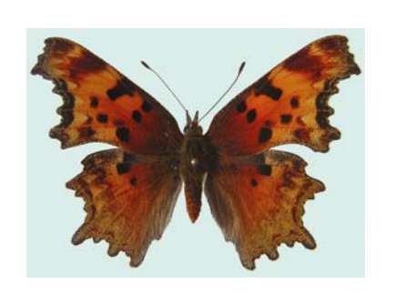
Satyr Comma (Polygonia satyrus Hoary Comma (Polygonia gracilis zephyrus ) Can be found in mountain canyons from spring until June. A fresh generation appears from high elevation during August and September.