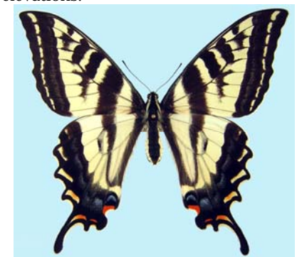
Pale Swallowtail ( Papilio eurymedon) Female pictured.