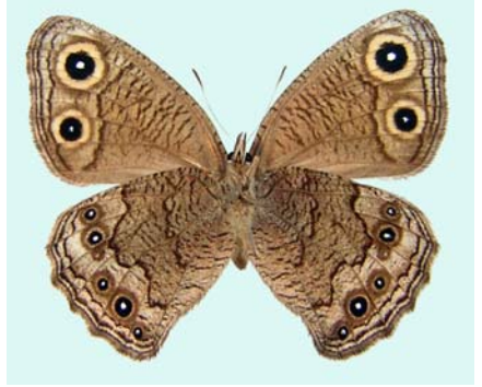
Great Basin Wood Nymph ( Cercyonis sthenele masoni ) (Female ventral surface pictured.)