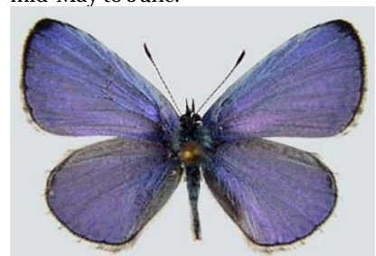
Spring Azure ( Celastrina ladon echo ) Flies in association with choke cherries and can be found in late April into May.