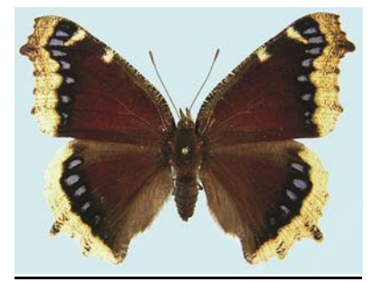
Mourning Cloak ( Nymphalis antiopa ) Flies along water courses in valleys and mountains throughout the state appearing the first warm days of late winter.

With exception of the mourning cloak, these butterflies emerged early the previous fall from higher elevations and worked their way down the canyon towards lower elevations where temperatures remained warmer for a longer period of time. As spring progresses, these butterflies will return to higher elevations to mate and repeat their life cycle.