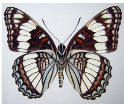
Weidemeyer's Admiral ( Limenitis weidemeyeri latifascia) Male ventral surface. Larvae feed on willows, poplars, choke cherries, and aspens.