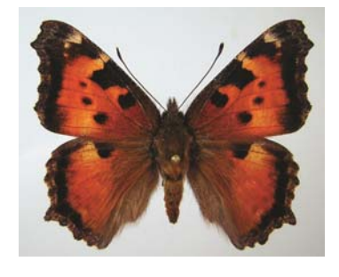
California Tortoiseshell ( Nymphalis californica ) Flies in the lower canyons in early spring working its way to higher elevations in mid summer.