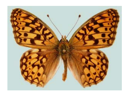
Callippe Fritillary ( Speyeria callippe harmonia) One of the first fritillaries to emerge in late May and early June. The green coloration of the ventral hind wing disc makes this fritillary unique compared to others in the state.