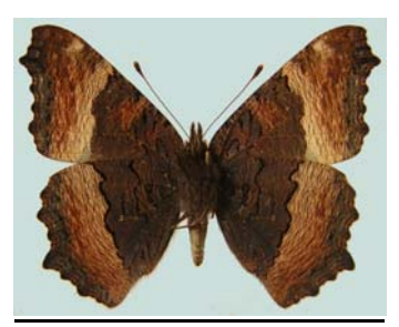
Milbert's Tortoiseshell (Nymphalis Satyr Comma (Polygonia satyrus milberti furcillata) Ventral surface