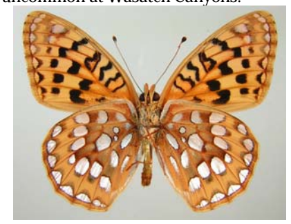
Zerene Fritillary (Speyeria zerene platina) ) The silver spots on the ventral hind wing disc of the Zerene Fritillary are larger than on the Hesperis or Great Basin Fritillaries.