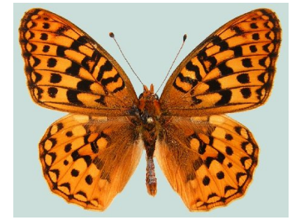
Zerene Fritillary (Speyeria zerene platina) The Zerene Fritillary can be quite common at mid-elevation Wasatch Canyons and may be scarce at Wasatch Canyons.