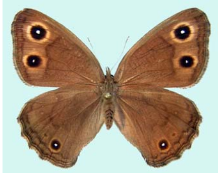
Great Basin Wood Nymph ( Cercyonis sthenele masoni ) (Female pictured). Females of the great basin wood nymph are more common in August and September.