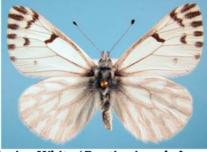
Spring White (Pontia sisymbri) Flies near mountain canvon trails and hillsides during the latter part of April.