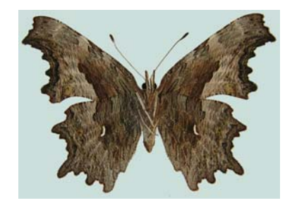
Hoary Comma (Polygonia gracilis zephyrus ) Underside view. (Also known as the ventral surface.)