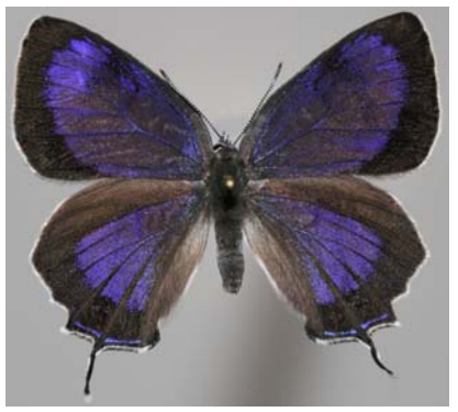
Colorado Hairstreak (Hypaurotis crysalus citima) Male pictured. Flies in close proximity to its larval host plants scrub oak (Quercus gambellii)

Another butterfly that can be extremely common towards the latter end of August through September and into October is the woodland skipper ( Ochlodes sylvanoides napa .) This skipper may visit some blooming flowers at the Wasatch Canyons during this timeframe.