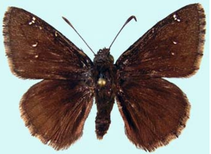
Northern Cloudywing ( Thorybes pylades ) This dark skipper appears in late April and early May in our canyons and looks like duskywings in flight. The lesser amount of gray markings on the dorsal forewing will distinguish it. Its larvae feed on Sweet Clover.