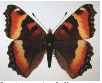
Milbert's Tortoiseshell (Nymphalis milberti furcillata) Flies in the valley floors near rivers during the summer. This temporal migrator is equally at home at the canyon mouths in April, midelevation canyons in June and the tops of the mountains in August.