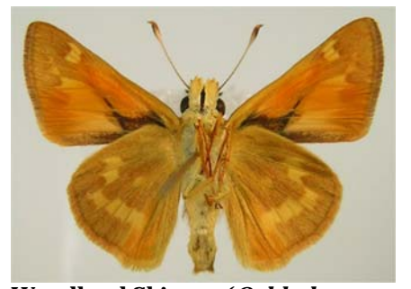
Woodland Skipper ( Ochlodes sylvanoides napa ) Male ventral surface pictured.

One of the delectable blooming wildflowers growing near the mouth of canyons along the Wasatch Front in September is redroot buckwheat ( Eriogonum racemosum ). Unlike other butterflies that frequent our canyons during the spring and summer months, the spalding blue butterfly ( Euphilotes spaldingi) does not emerge from its chrysalis until the redroot buckwheat is nearly in bloom in late August through September. Also, females of the gray hairstreak ( Strymon melinus franki ) also will lay eggs on