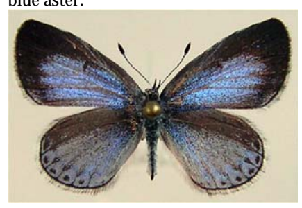
Spring Azure ( Celastrina ladon echo ) Female is pictured.