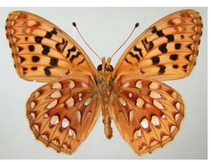
Great Basin Fritillary (Speyeria egleis utahensis) The color of the ventral hind wing disc on this fritillary is rusty brown with small patches of tannish coloration.