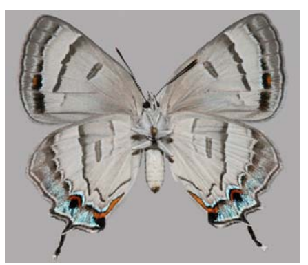
Colorado Hairstreak ( Hypaurotis crysalus citima ) Female underside pictured.