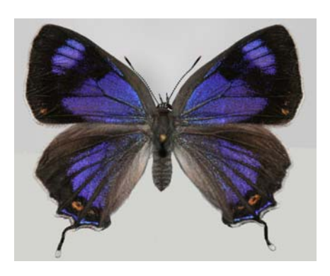
Colorado Hairstreak ( Hypaurotis crysalus citima) Female pictured.