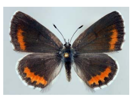
Spalding Blue ( Euphilotes spaldingi ) Female pictured.