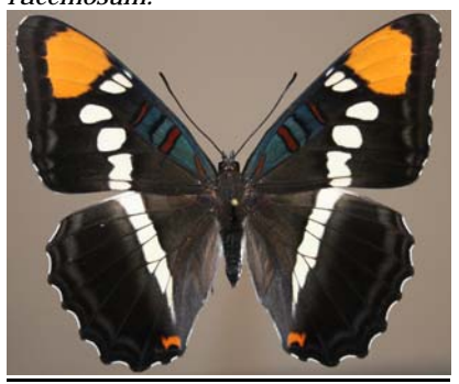
Arizona Sister (Adelpha eulalia) Female pictured. This gorgeous butterfly is not as common in Northern Utah as it is Southern Utah; but can be found occasionally flying in gullies and ravines in late August through September. Caterpillars feed on scrub oak.