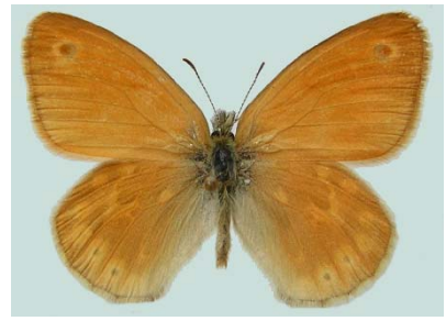
Common Ringlet ( Coenonympha tullia brenda ) The hop flight of this and other satyrid butterflies is somewhat different. Adults start appearing in mid-May.