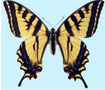
Western Tiger Swallowtail ( Papilio rutulus rutulus ) Female pictured.