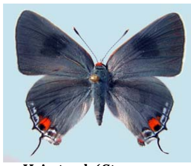
Gray Hairstreak (Strymon melinus franki) Muliple flights starting in April and ending in September. Caterpillars can be found on Astragalus or Hedysarum blooms in the spring and Eriogonum racemosum blooms in the fall.