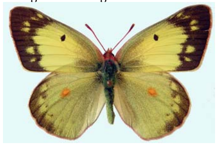
Yellow Sulphur ( Colias philodice eriphyle ) Female is pictured.