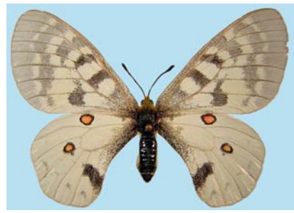
Clodius Parnassian (Parnassius clodius menetriesi) Males fly along hillsides and near canyons from mid-May to June.