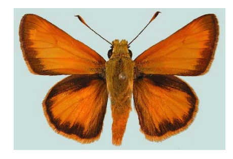
Taxiles Skipper ( Poanes taxiles ) Males emerge in late June and patrol and perch along trails near waterways