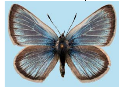
Silvery Blue (Glaucopsyche lygdamus oro) Flies in ravines and dry gullies in lower canyons during the middle of April. Females lay eggs on Hedysarum boreale.