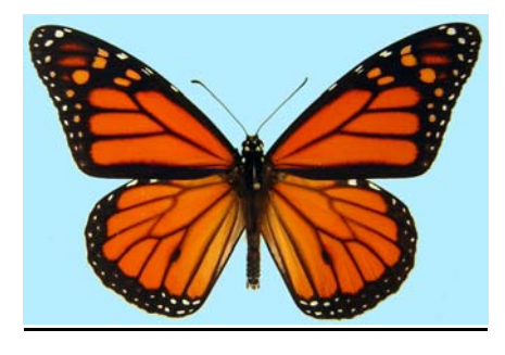
The Monarch ( Danaus plexippus ) Migrates to Northern Utah from Mexico and California. Occasional adults may be found in Canyons along the Wasatch Front if there is larval host milkweed ( Asclepias speciosa ) nearby. This butterfly is mostly located in Russian olive groves near agricultural areas.