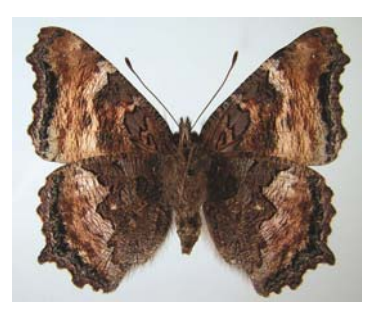
California Tortoiseshell ( Nymphalis californica ) Ventral surface pictured.