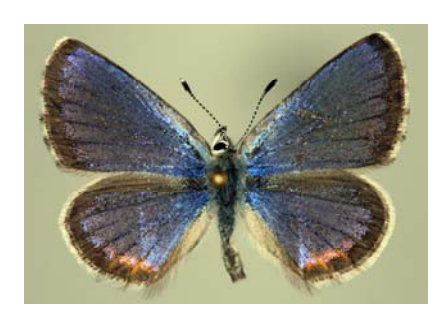
Spalding Blue ( Euphilotes spaldingi ) Male pictured. This butterfly flies in Wasatch Canyons in association with Eriogonum racemosum.

Another butterfly that can be occasionally found in canyons in Utah and Salt Lake County is the Arizona Sister. Populations of this butterfly tend to become less common the further north you venture. The furthest north I have found this butterfly is in Farmington Canyon in Davis County.