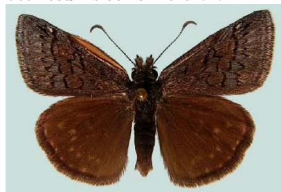
Sleepy Duskywing (Erynnis brizo Rocky Mountain Duskywing burgessi ) Males patrol dry washes in lower canyons in late April and May.