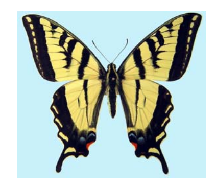
Western Tiger Swallowtail ( Papilio rutulus rutulus ) Males patrol along moist mountain canyons between May and August. This butterfly might be rare at Wasatch Canyons; but more common at higher elevations.