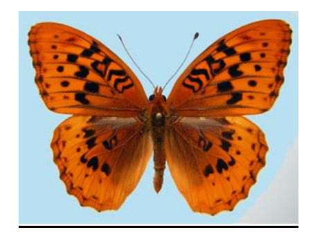
Great Spangled Fritillary ( Speyeria cybele letona ) Male dorsal surface.