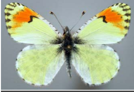
Southern Rocky Mountain Orangetip (Anthocharis julia browningi) Females are less noticeable and can be found mostly in May.