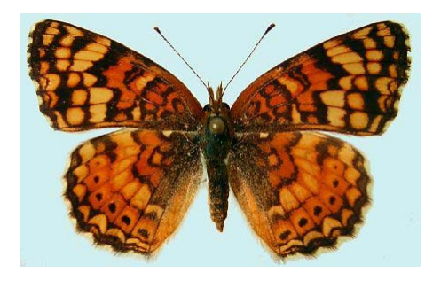
Thistle Crescent (Phyciodes mylitta mylitta) Flies in ravines and dry gullies in lower canyons during the middle of April. Larvae feed on thistles.