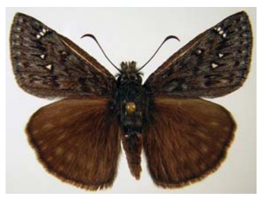
(Erynnis telemachus) Males patrol and perch in dry washes.