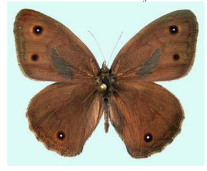
Great Basin Wood Nymph ( Cercyonis sthenele masoni ) (Male pictured). This butterfly begins flying in early July and continues into August and September.