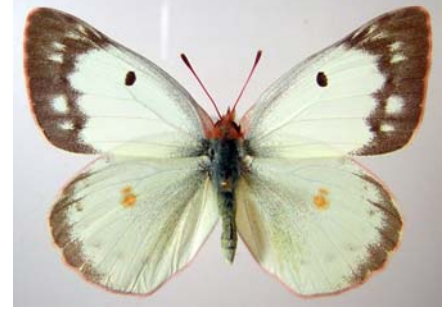
Yellow Sulphur ( Colias philodice eriphyle ) Female (albinic form) is pictured.