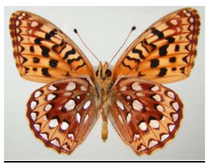
Northwestern Fritillary (Speyeria hesperis wasatchia) The color of the ventral hind wing disc is much darker red as compared to the Great Basin Fritillary.