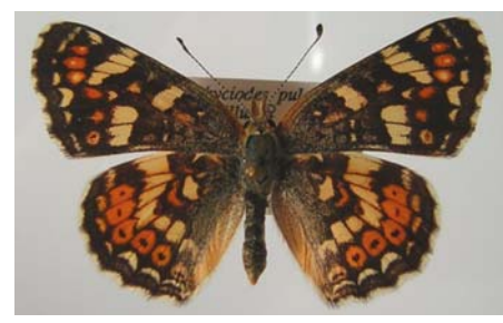
Field Crescent ( Phyciodes pulchellus camillus ) Female is pictured.