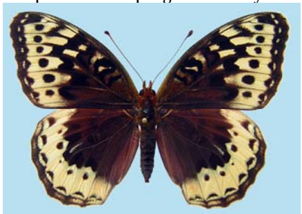
Great Spangled Fritillary ( Speyeria cybele letona ) Female dorsal surface.