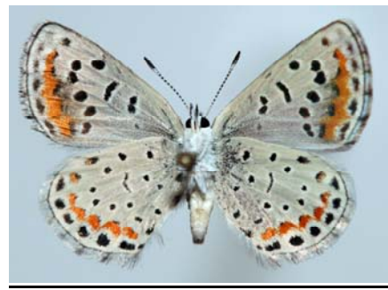
Spalding Blue ( Euphilotes spaldingi ) Male ventral surface is pictured.