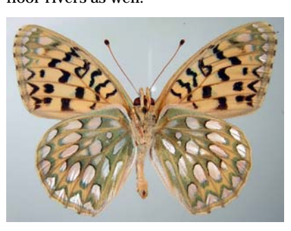
Callippe Fritillary (Speyeria callippe harmonia) Male ventral surface.