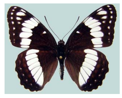
Weidemeyer's Admiral ( Limenitis weidemeyeri latifascia ) Males patrol and perch along mountainous canyons and dry gullies that have willow between May and July. Scarcely files along valley floor rivers as well.

In June, species that may start flying in our canyons include the western tiger swallowtail ( Papilio rutulus rutulus ), pale swallowtail ( Papilio eurymedon ), coronis fritillary ( Speyeria coronis snyderi ), callippe fritillary ( Speyeria callippe harmonia ), and the weidemeyer's admiral ( Limenitis weidemeyeri latifascia ). You may find great spangled fritillaries ( Speyeria cybele letona ); but, they tend to prefer higher elevations in the Wasatch Mountains. A fresh emergence of mourning cloaks can also be seen in June.