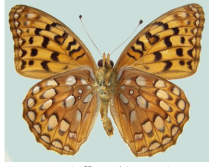
Coronis Fritillary (Speyeria coronis snyderi) The ventral surface markings on this male are superficially similar to the Zerene Fritillary; but the Coronis Fritillary is larger.