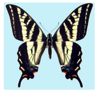
Pale Swallowtail ( Papilio eurymedon) Males patrol along mountainous canyons and sometimes dry gullies from late May and July. The larvae feed on a plant that grows at roughly 7000' to 9500' ( Ceanothus velutinus)