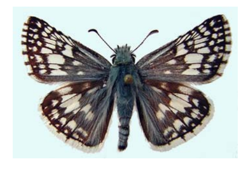
Common Checkered Skipper ( Pyrgus communis ) Males quickly fly around ravines, trails, and dry washes in canyons. Caterpillars feed on cheese weed ( Malva neglecta .)