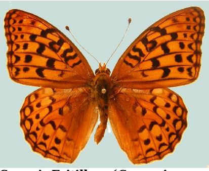
Coronis Fritillary (Speyeria coronis snyderi) Males appear a few days after Callippe Fritillaries; but females remain scarce almost until fall. The adults of this fritillary are larger than all others that fly in the Wasatch Front; except the Great Spangled Fritillary.