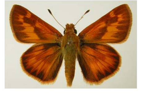
Woodland Skipper (Ochlodes sylvanoides napa) Female pictured.