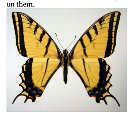
Two Tailed Swallowtail ( Papilio multicaudatus pusillus ) Males of this very large butterfly fly along mountain streams and city streets lined with ash trees from May to July. Females lay eggs on choke cherries in Wasatch Canyons.