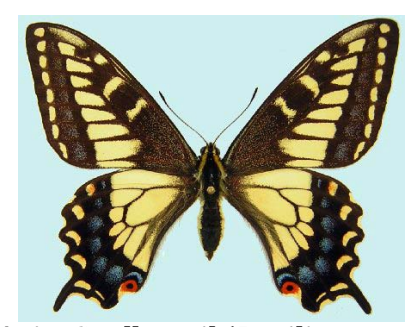
Anise Swallowtail (Papilio zelicaon nitra ) Flies near mountain canyon trails and hillsides

males of the very large two tailed swallowtail (Papilio multicaudatus pusillus) patrol gracefully up and down the canyons.