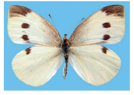
Cabbage White ( Pieris rapae ) Introduced from Europe, the cabbage white can be a dominant butterfly in Salt Lake Valley as well as in the mouths of our canyons from April through October. Larvae feed on broccoli, cauliflower, cabbage as well as native and invasive mustards.